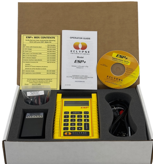
P/N: 980-ESP-00256 ESP+ FAULT LOCATOR METER