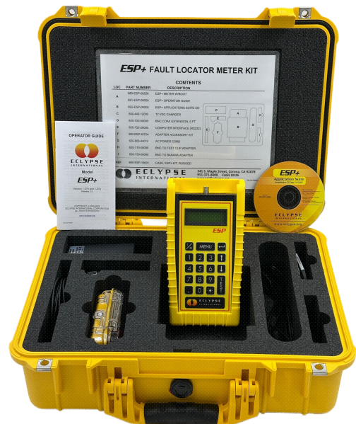
P/N: 980-ESP-00256-02 ESP+ FAULT LOCATOR METER KIT